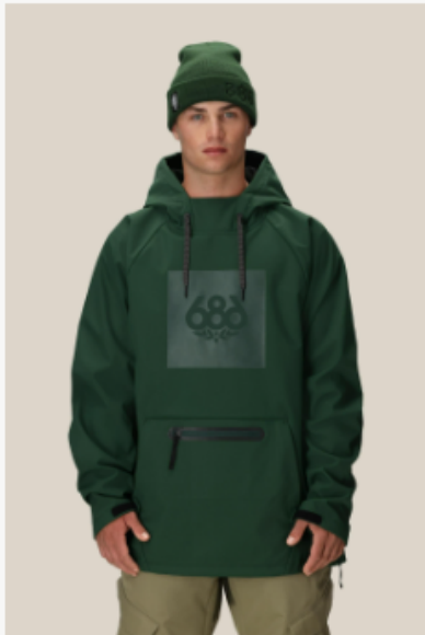
Model is 6'0", Waist: 31 in., Chest: 38.5 in. in a size Large