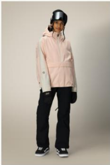
Model is 5'8", Waist: 27 in. in a size Small