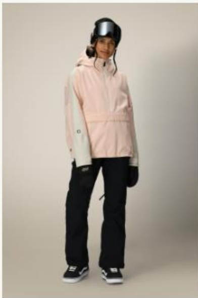
Model is 5'8", Waist: 27 in. in a size Small