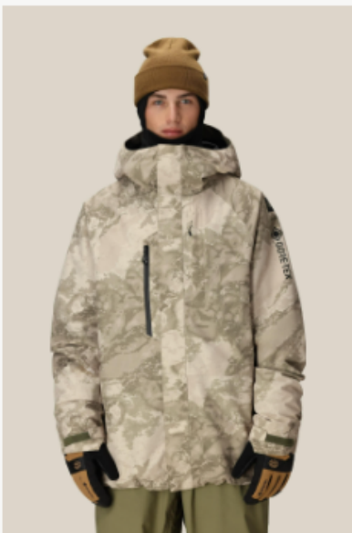
Height: 6' 1" (186cm), Chest: 38" (97cm) in a size Large