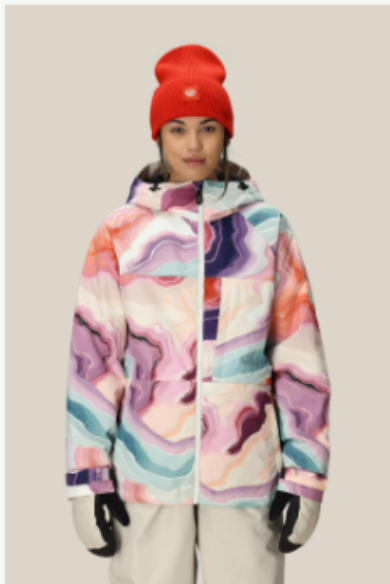
Model is 5'8", Waist: 27 in., Bust: 32 in. in a size Small