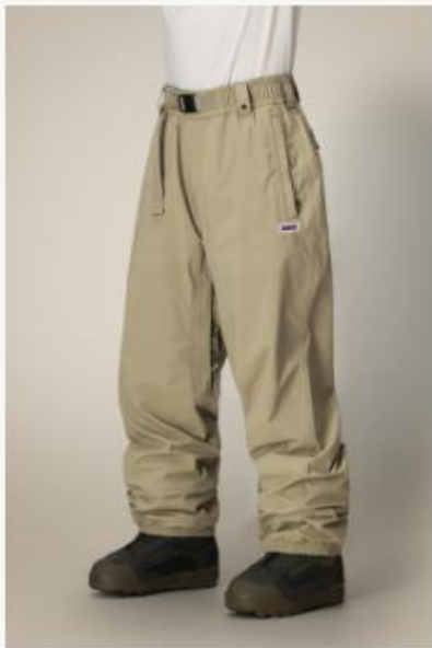
Model is 5'11", Waist: 30.5 in. in a size Large