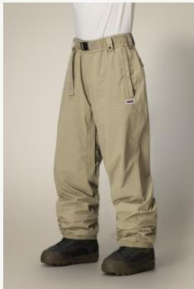
Model is 5'11", Waist: 30.5 in. in a size Large